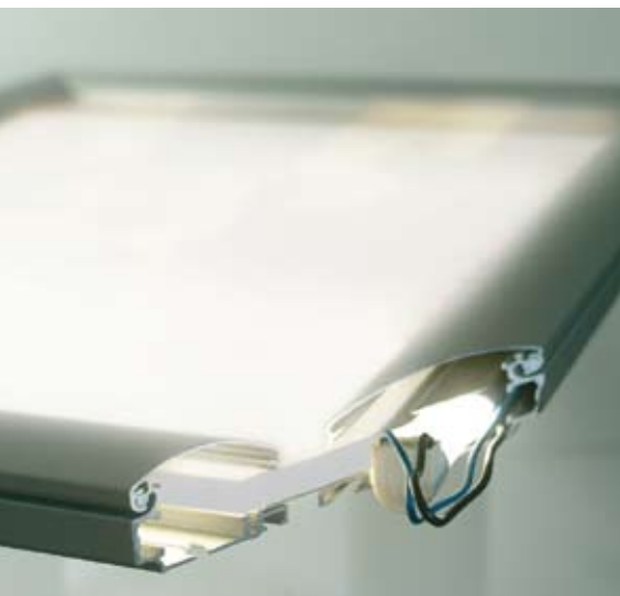
Sectional drawing of an edge-lit display featuring PLEXIGLAS® EndLighten

Enables the construction of extremely slim, compact luminous panels with high light output.